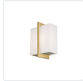
WS39210-BG Brushed Gold